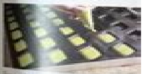
Remplir les Flexipan® tozanges à pâte à la pistache.