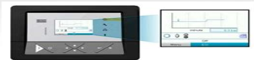
Real time trending

The superior processing capability of the Elektronikon® Mk5 enables a compressor of almost any age or type to benefit from the latest and most advanced control algorithms and functionality, resulting in improved system control and energy savings.